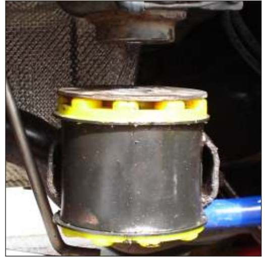
Fig 2. Rear mount - OE washers shown.