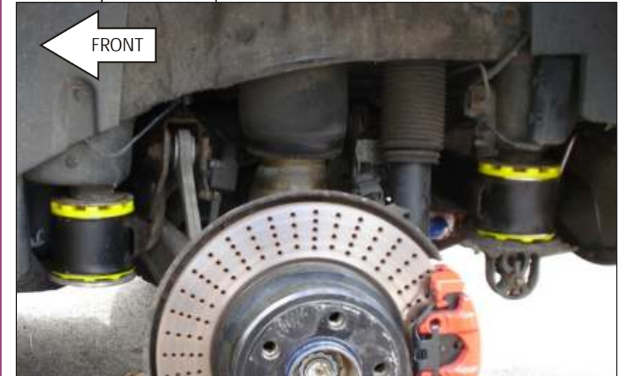
Fig 3. Front and rear mount - complete assembly.