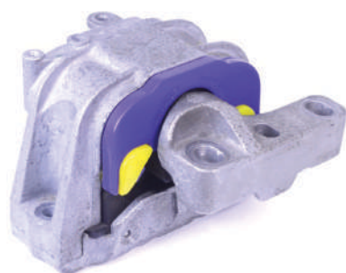
Figure 4 - showing all polyurethane inserts fitted inside the upper engine mount